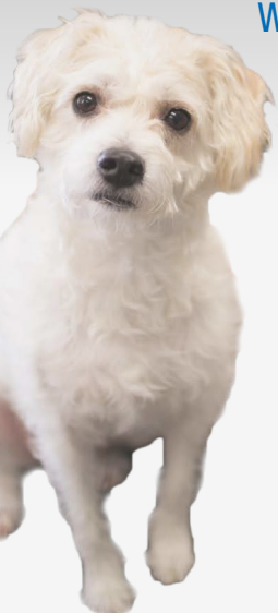
Oliver, Corporate Pooch

We've been making our customers' lives easier for the past twelve years. Let us do the same for you.